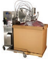
Bulk Bin Roll Around