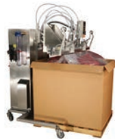
Bulk Bin Roll Around