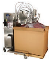
Bulk Bin Roll Around